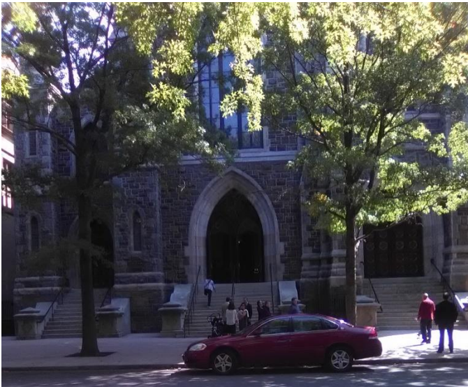
St. Mary's Church, New Haven, CT

The College Council Service Program awards recognize outstanding council programs in six key areas of outreach — Church, Community, Council, Family, Youth and Culture of Life— during the preceding fraternal year. Whether ongoing or one-time initiatives, these programs embody the spirit of the Order and serve as an inspiration for all Knights of Columbus.