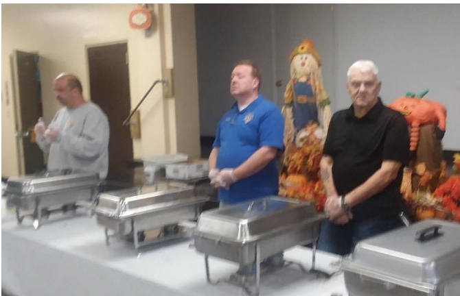
Helping Hands to benefit New Beginnings soup kitchen .....while doing good works.