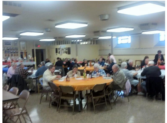
Patrons at the New Beginnings fundraiser

The Council was assisted in serving the breakfast by Girl Scout Troop 360, also based at All Saints. This was a great example of multiple organizations coming together to help those in need.