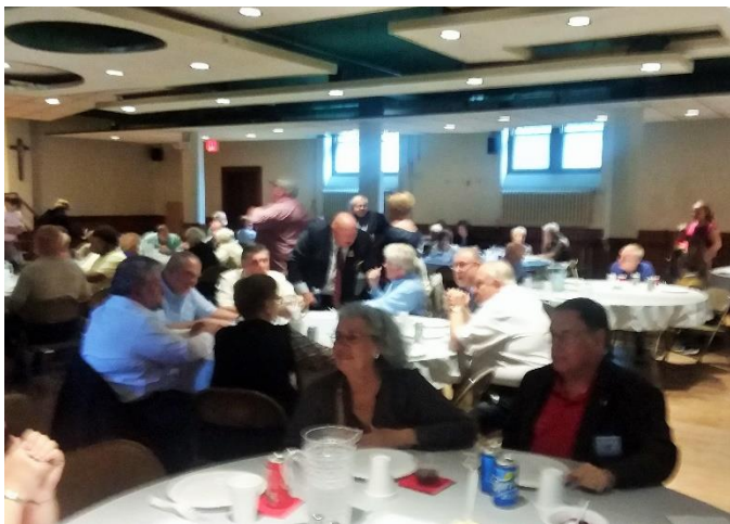
Pascoag Harvest Supper Attendees

By all accounts it was a rousing success and its return was welcomed by many from around the State.